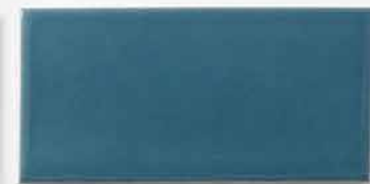
Architectonics2 in OXFORD

Material: Glass Glaze/Finish: Glossy Solid