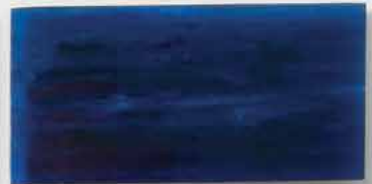
Repose in SPACE

Material: Ceramic Glaze/Finish: Dynamic Crackle