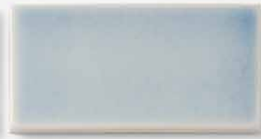
Architectonics2 in ABALONE

Material: Ceramic Glaze/Finish: Glossy Solid