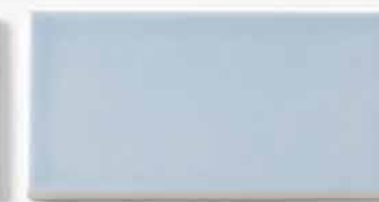
Architectonics2 in LARKSPUR

Material: Ceramic Glaze/Finish: Matte Solid