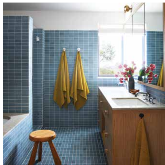
Designer Studio Shamshiri