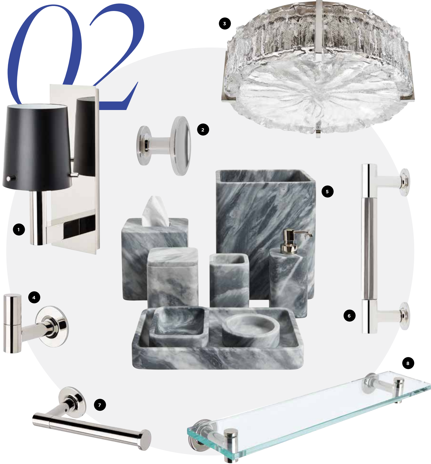
1. CATIA LED Sconce in Nickel/Black CILT01 2. BOND 1 1/4" Tapered Knob in Nickel BNHW11 3. MARLON Flush Mount Light in Nickel MNLT05 4. BOND Robe Hook in Nickel BRHO01 5. SCURO Stone Countertop Accessories in Bardiglio 6. BOND 4" Pull with Guilloche Lines in Nickel BNHW04 7. BOND Paper Holder in Nickel BPH001 8. BOND 18" Shelf in Nickel BSF018

Featured products are an edited selection of our comprehensive assortment of modern accessories