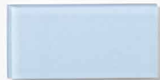
Kromaglas in LAGOON

Material: Ceramic Glaze/Finish: Dynamic Crackle