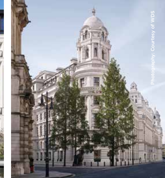
The OWO Residences by Raffles

You'll find Waterworks in some of London's most exclusive hotels and iconic residences, from elegant Mayfair to picturesque Chelsea.