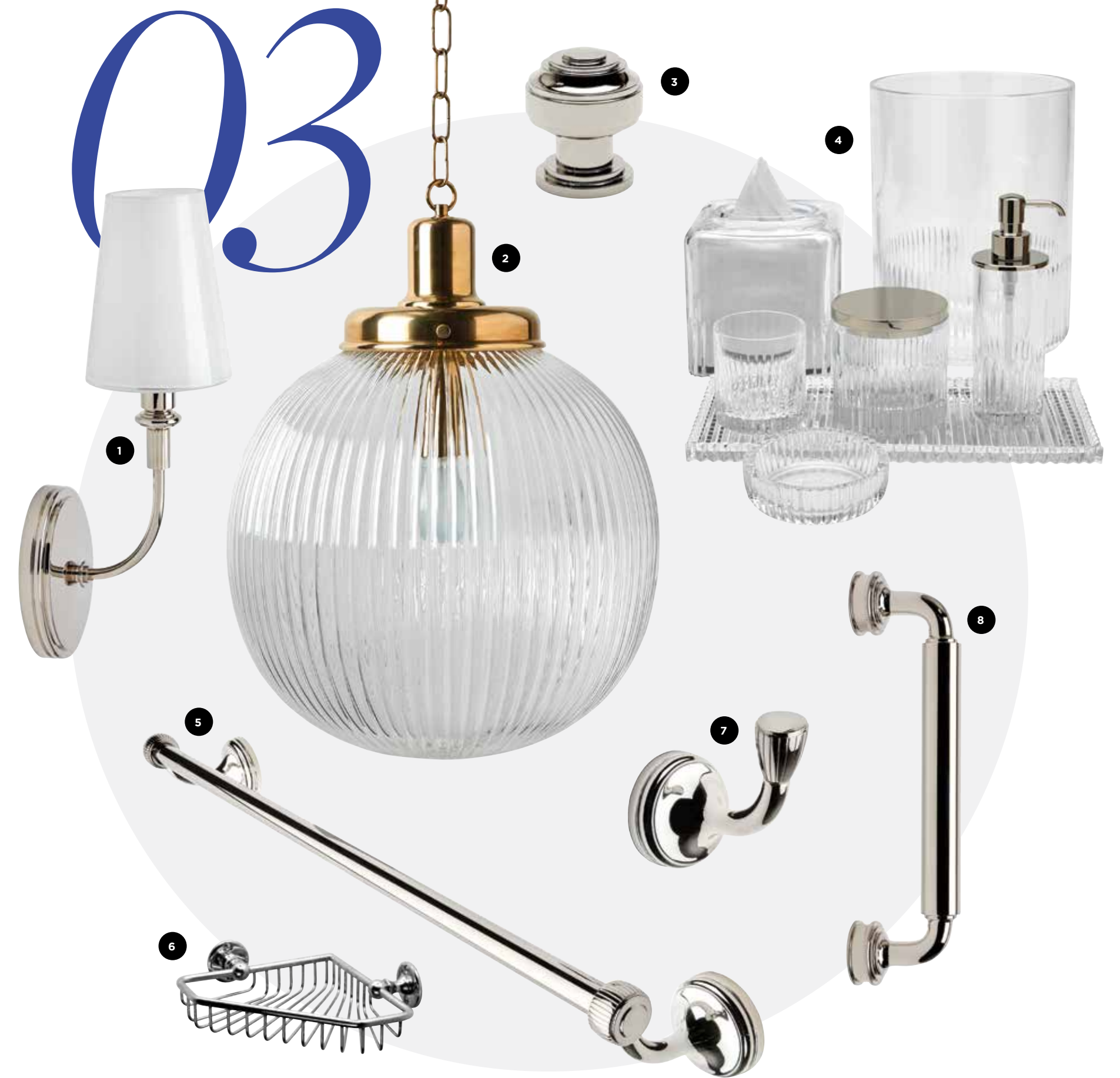
1. FORO Sconce with Glass Shade in Nickel FRLT01 2. AURORA Pendant with Glass Shade in Brass AALT01 3. AERO 1 1/4" Post Knob in Nickel AEHW02 4. PIERRE Crystal Countertop Accessories in Clear/Nickel 5. FORO 24" Towel Bar in Nickel FRTB24 6. CRYSTAL Soap Basket in Nickel CRBA27 7. FORO Robe Hook in Nickel FRRHO1 8. AERO 6" Pull in Nickel AEHW06

Featured products are an edited selection of our comprehensive assortment of classic accessories