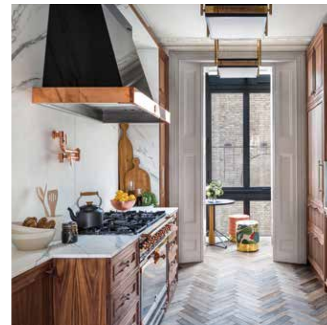
Designer Brown Design Group