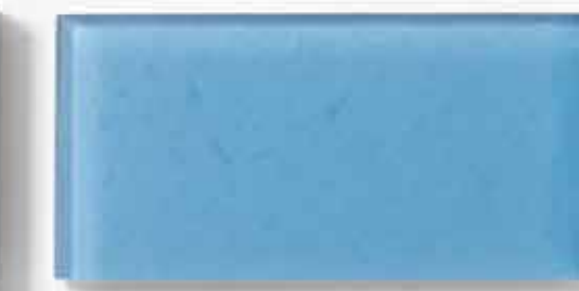
Kromaglas in SKY BLUE

Material: Glass Glaze/Finish: Glossy Solid