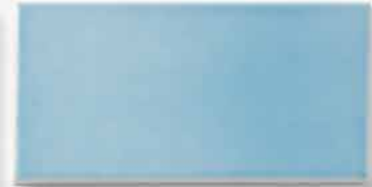
Architectonics2 in BELLE

Material: Ceramic Glaze/Finish: Glossy Solid