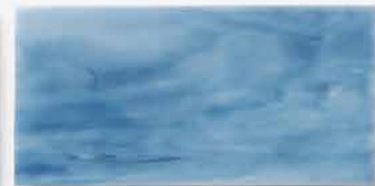
Repose in POOLSIDE

Material: Glass Glaze/Finish: Glossy Solid