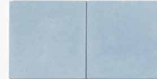
Portlandia in CORNFLOWER

Material: Ceramic Glaze/Finish: Matte Solid