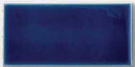
Architectonics2 in INDIGO

Material: Glass Glaze/Finish: Glossy Solid