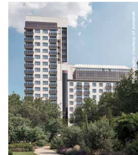
The Carlton Tower Jumeirah

You'll find Waterworks in some of London's most exclusive hotels and iconic residences, from elegant Mayfair to picturesque Chelsea.