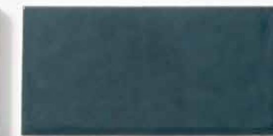
Architectonics2 in SPRUCE

Material: Ceramic Glaze/Finish: Glossy Crackle