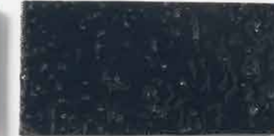
Grove Twenty in NAVY

Material: Ceramic Glaze/Finish: Glossy Solid