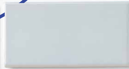
Architectonics2 in CINDER

Material: Ceramic Glaze/Finish: Glossy Solid