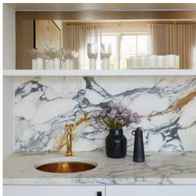
Designer Grisoro Design