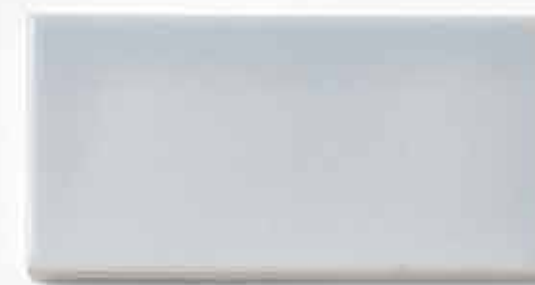
Architectonics2 in NIMBUS

Material: Ceramic Glaze/Finish: Matte Solid