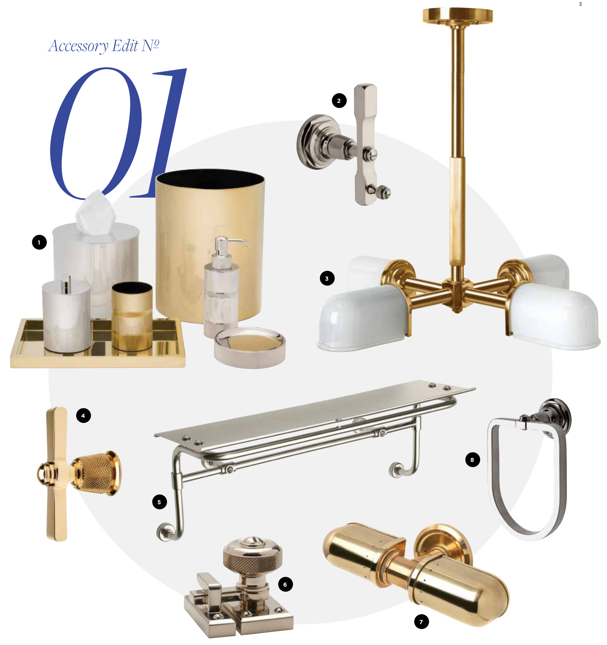
1. LUSTER Countertop Accessories in Brass & Nickel 2. R.W. ATLAS Robe Hook in Burnished Nickel RWRH01 3. R.W. ATLAS Pendant with Glass Shades in Brass RWLTO7 4. R.W. ATLAS Wing Pull in Brass RWHW08 5. R.W. ATLAS 18" Shelf in Burnished Nickel RWSF18 6. R.W. ATLAS Latch with Knob in Burnished Nickel RWHW09 7. R.W. ATLAS Sconce with Metal Shades in Brass RWLTO6 8. R.W. ATLAS Towel Ring in Burnished Nickel RWTB01

Orchestrate a cohesive, stylish environment. A perfect combination of function and design, our accessories are the solution to complex layering.