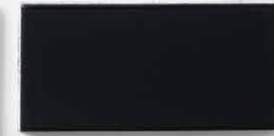
Architectonics2 in FALCON

Material: Ceramic Glaze/Finish: Matte Solid