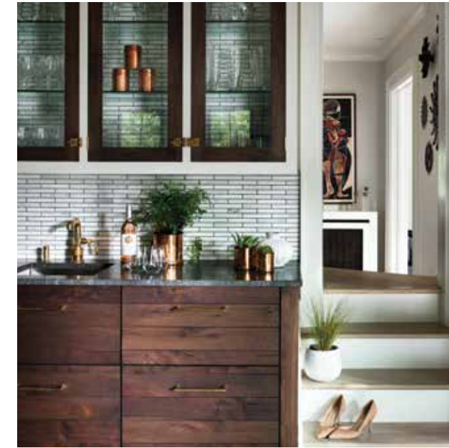
Designer Studio Dearborn