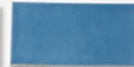
Architectonics2 in DENIM

Material: Glass Glaze/Finish: Glossy Solid