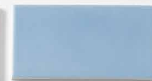
Architectonics2 in CELESTIAL

Material: Ceramic Glaze/Finish: Glossy Solid