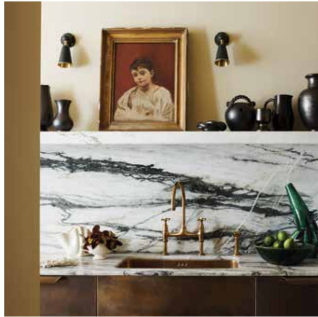
Designer Maddux Creative