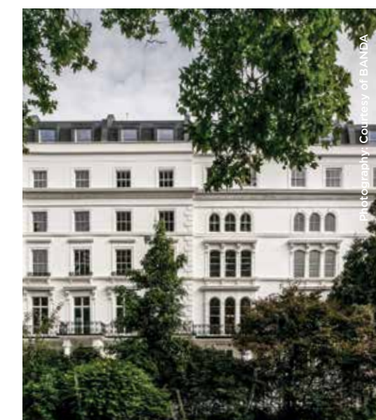
13-19 Leinster Square