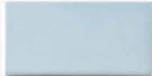
Architectonics2 in ANGELICA

Material: Glass Glaze/Finish: Glossy & Matte Solid