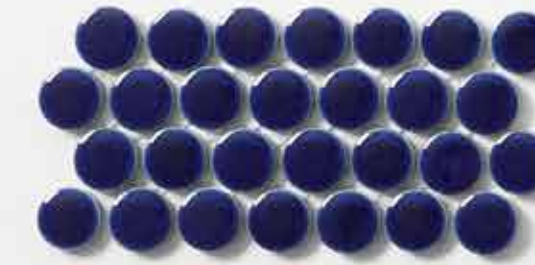
Disc in FLEET

Material: Porcelain Glaze/Finish: Glossy