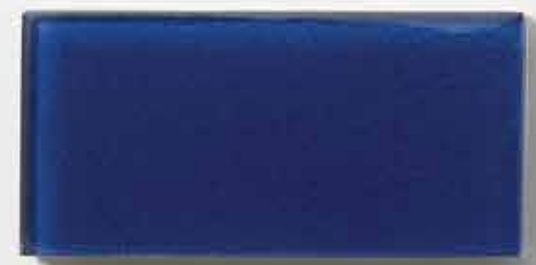
Kromaglas in ROYAL

Material: Ceramic Glaze/Finish: Glossy Solid