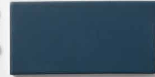
Architectonics2 in EVENING SKY

Material: Porcelain Glaze/Finish: Glossy