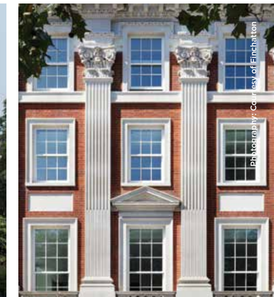
20 Grosvenor Square