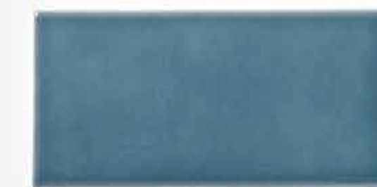
Architectonics2 in ELLA

Material: Ceramic Glaze/Finish: Glossy Solid