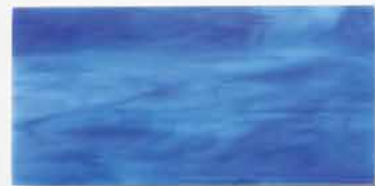
Repose in CORNFLOWER

Material: Ceramic Glaze/Finish: Glossy Solid