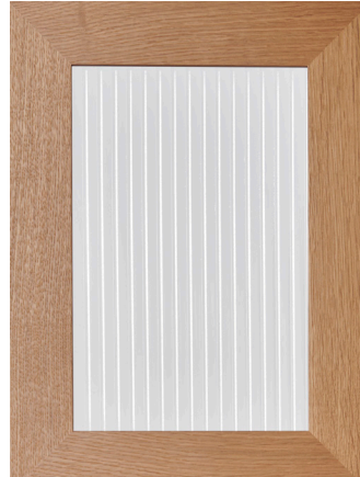
ALTA RIBBED GLASS