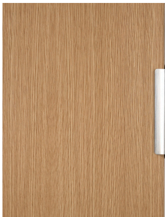
ALTA INTEGRATED HARDWARE